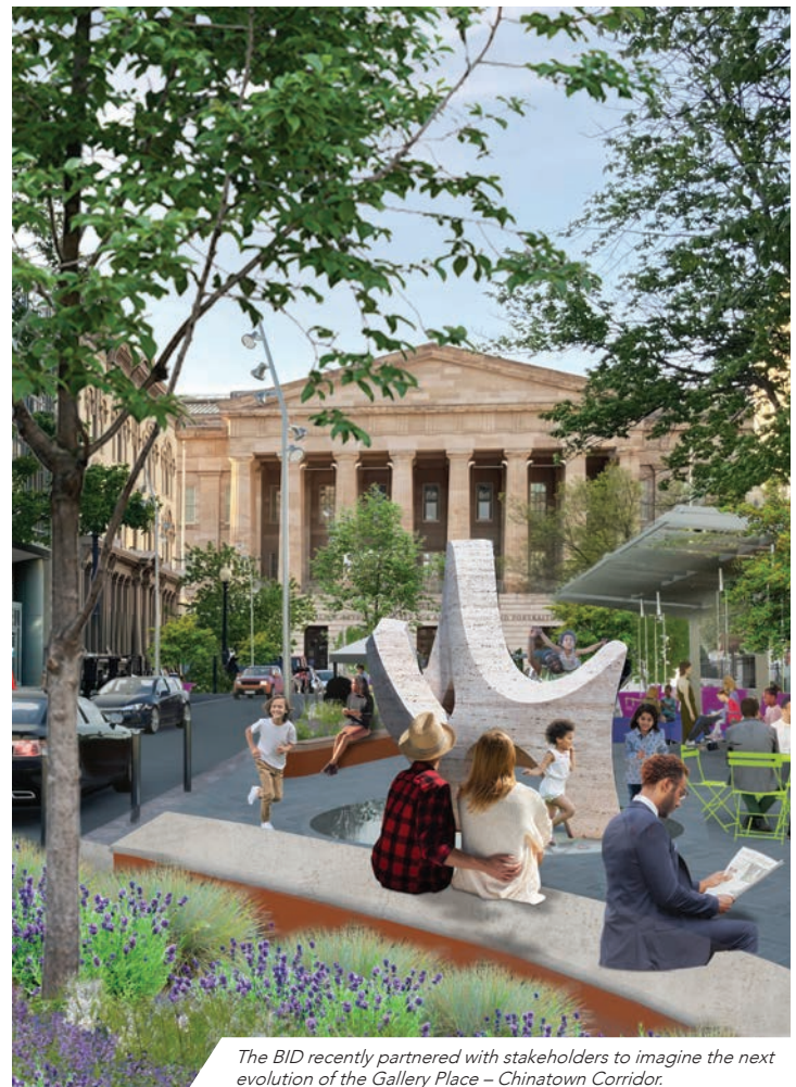
The BID recently partnered with stakeholders to imagine the next evolution of the Gallery Place – Chinatown Corridor.