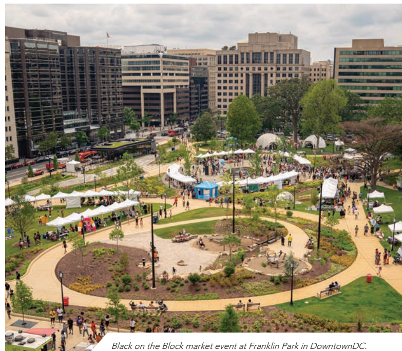
Black on the Block market event at Franklin Park in DowntownDC.

Over the past 25 years, the BID has evolved from its initial focus on the fundamentals of place management to playing an integral role in building a city where people, places, and businesses thrive.