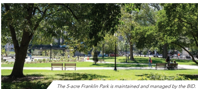
The 5-acre Franklin Park is maintained and managed by the BID.